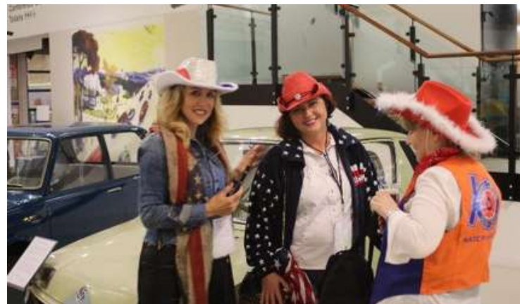
International Night at the British Motor Museum

or follow us on Facebook 41 INTERNATIONAL a.s.b.l. | Facebook