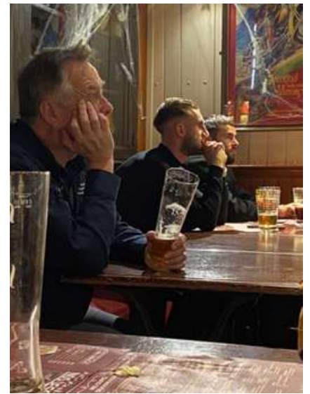
Someone concerned about the All Blacks