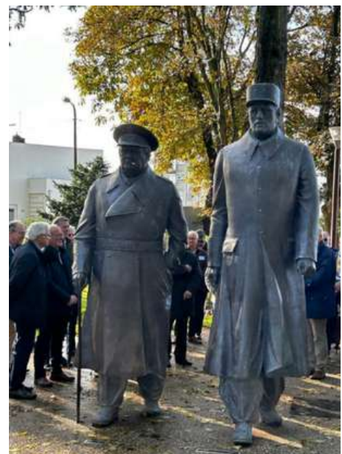
A couple of important chaps from history