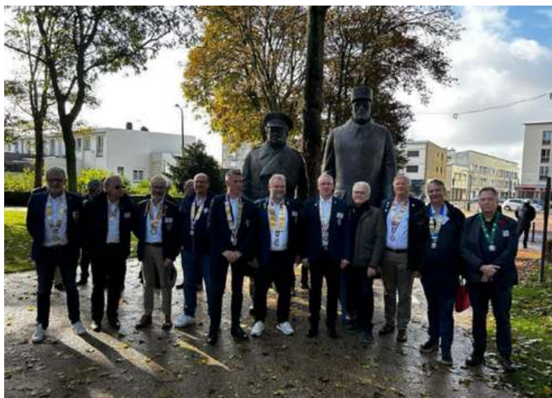
A collection of gongs!