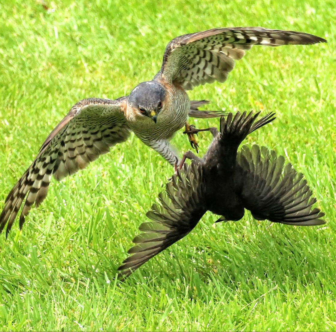
SPARROWHAWK ATTACK - BY DAVID HEWITT. WHITCHURCH & DISTRICT 41 CLUB. WINNING ENTRY IN THE 41 CLUB & TANGENT NATIONAL PHOTOGRAPHY COMPETITION 2020.

YOUR HANDBOOK TO MEMBERSHIP OF THE ASSOCIATION OF EX-ROUND TABLERS' CLUBS