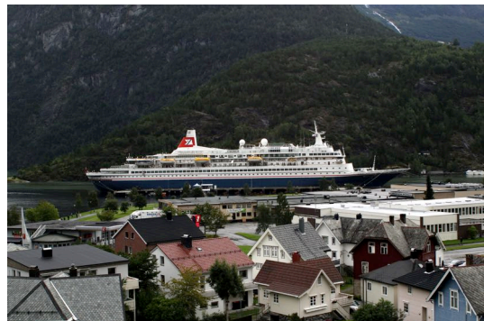
Black Watch moored at her berth in Hellesylt