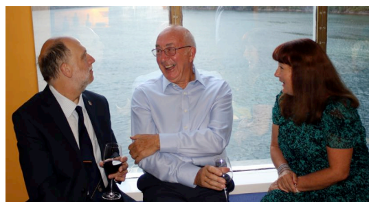
Enjoying a chat and a drink at the Club's cocktail party

Now for the goog news ..... whilst on the cruise we selected our cruise for 2019 and this is going to be something completely different ..... see the next page for details.