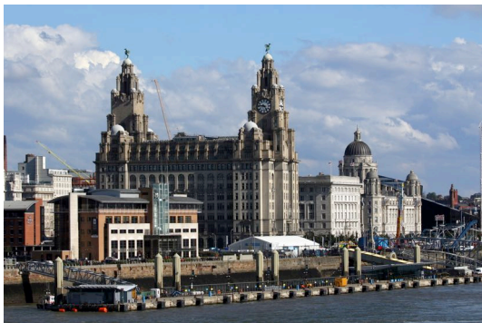
Departing Liverpool with the Three Graces on the waterfront

A full report on the cruise will be appearing in the Autumn Magazine, but in the meantime here are a few photographs taken on the cruise.