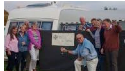
Alcester 41 Club at the 2017 Rally