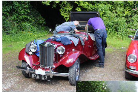
Memories from the Classic Rally 2017

For full details and a booking form CLICK HERE