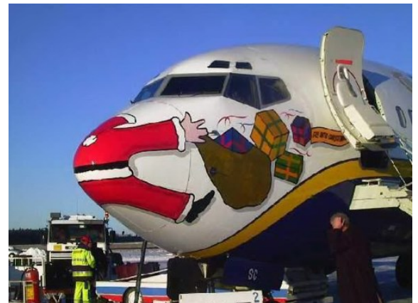
The perfect gift for the perfect granddad (or grandma)