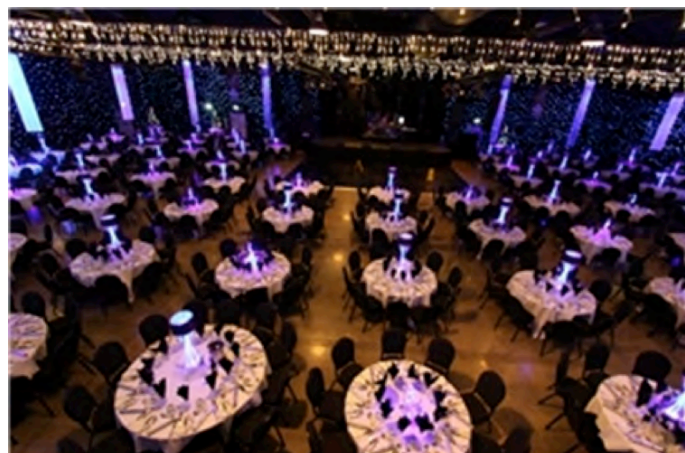
The Armouries Leeds