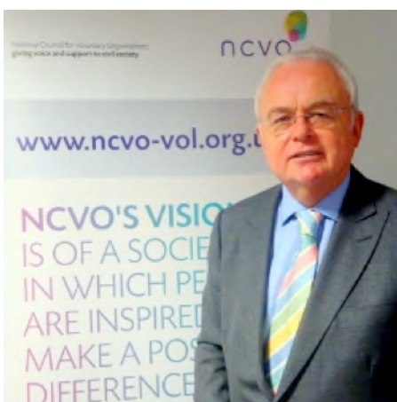
Martyn Lewis CBE