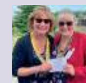
Page 14 Mumbles