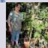
Page 13 Sunflower challenge