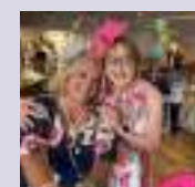
Page 4 Regional lunches