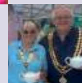
Page 5 Family brewing tea