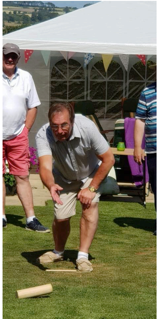
Good Fellowship weekend - Party Tyne are challenged