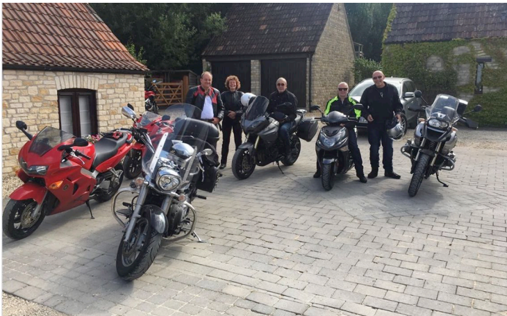
A lovely 'wobble' to AV8 Cafe (Kemble Airfield) for brunch - Keynsham 41 and Downend 41