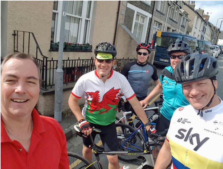
Heswall 41 Club Welsh Ride (Day 2)