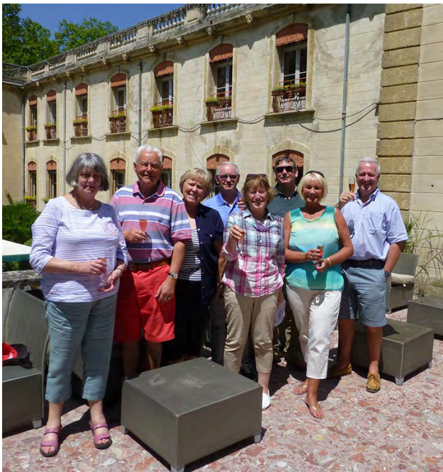
Troon 41 Club

While the travelling was straightforward in the early years, Ryanair soon decided that direct flights between Prestwick and Marseilles could not stay in their programme just to help some 41ers, so the routes became more complicated, but the weekend is still thriving.