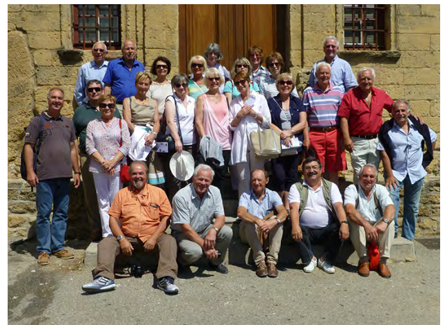
Aix and Troon 41ers and Wives