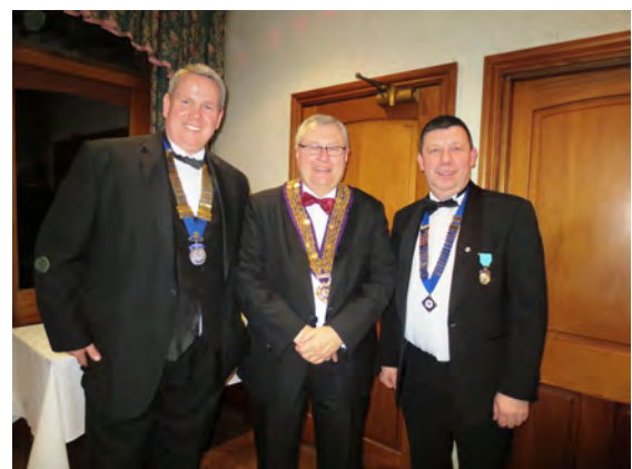
Bicester 41 and Table celebrating their Founders Night together